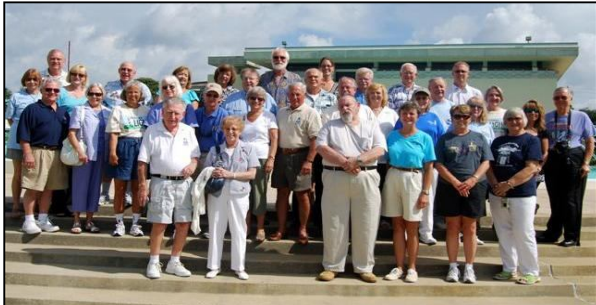
FLA'ers at Florida Southern College Water Dome

Our group posed before the restored Frank Lloyd Wright Water Dome for a group picture. See below. Our lighthouses are irreplaceable and tell the story of our maritime history and people. Let us be measured by results. Results count. Benjamin Franklin said: " Well done is better than well said. "