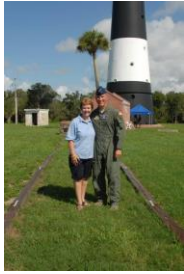
Before - Grassy walkway