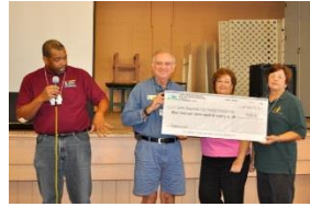
Check presentation Oct. 2011